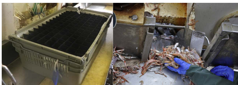
Fig. 2. Tray with individual cells in which Nephrops were kept during the monitoring period (left panel) and example of discarding chute system onboard a commercial trawler (right panel).